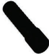
3" Extension Tube