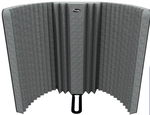
MudGuard Microphone Shield